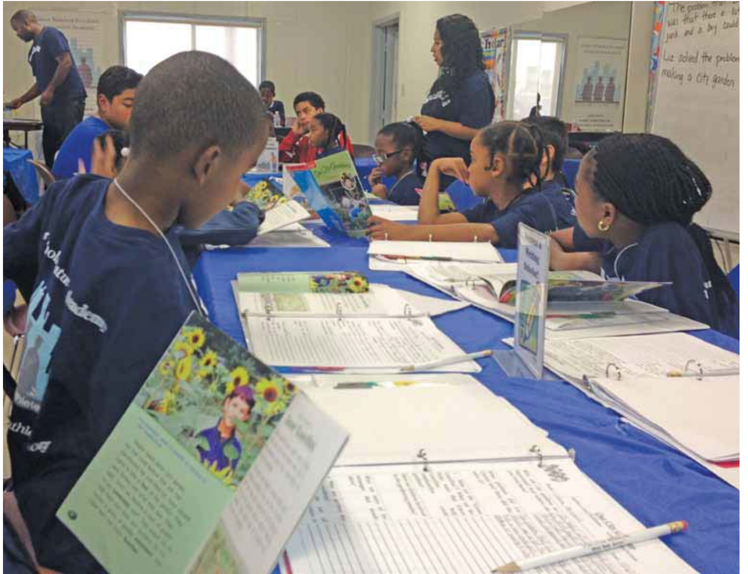
Kids from Urban Scholar Athletes sit and read during one of their Saturday scholar academy meetings. During these sessions, kids are exposed to a variety of fiction/nonfiction texts and participate in writing and hands-on activities related to the text in an effort to get them to become engaged, strengthen their comprehension and writing skills while developing a love for reading.